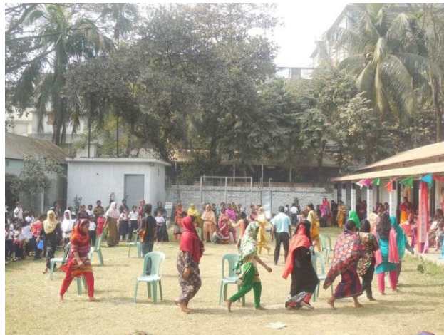
Events for guardians