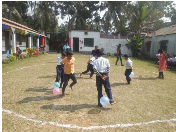
Events for students

On 23 th and 24 th January, Soham for All School of HOPE had their annual sports day. Almost all the students participated in the sports. All the selected students participated for final sports. They were four groups and each group had three types of game- like balance race, frog jump, potato collection, balloon blasting and go as you like. There were game for vocational students, parents and staff also. The winners were given prizes.