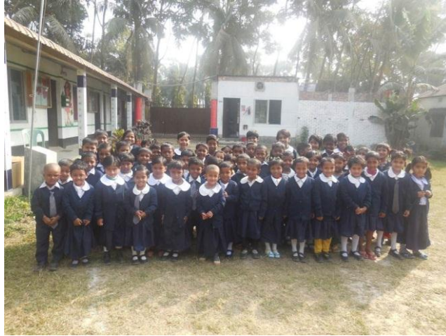
Students got new uniforms

On 15 th January Soham for All School of HOPE started their academic year. Including the new admitted students, we have 100 students in this year and we started class two. Now we have 64 girls and 36 boys in our school. We distributed uniform, new books, khata, bag and sweaters among them. We are looking forward for a successful academic year ahead.