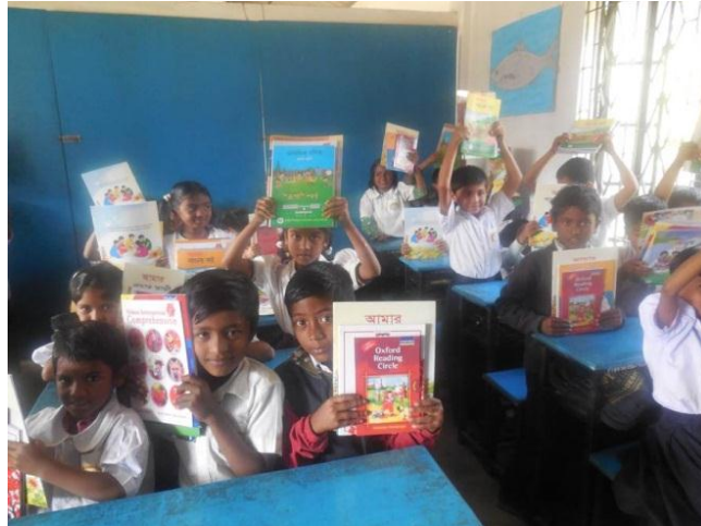
Students got new Books