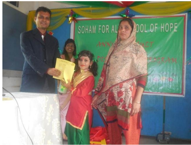
Students got prizes

On 20 th December, Soham for All School of HOPE distributed their annual report card among the students. Almost all the students were present with their parents on that day. Students performed some cultural program. The Program Director and Head Teacher discussed about their success and encouraged about coming year. Students who became 1 st , 2 nd and 3 rd got prizes and there were also many more categories like neat and clean, good behavior, good hand writing and students of the year. Students also enjoyed candy, fruits and polau with chicken.