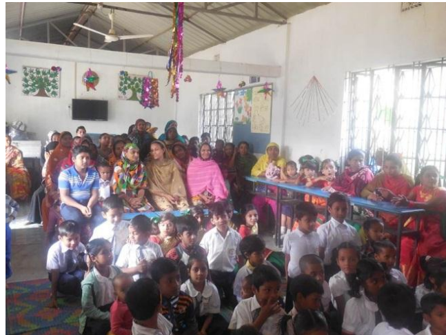
Parents were present