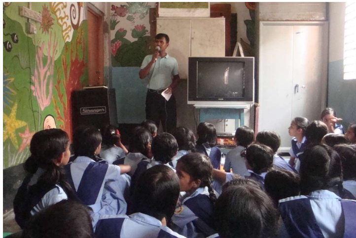
Head Teacher is speaking on the occasion

On 5 th June Jamgara School of HOPE observed the World Environment Day. All the teachers and the students were present in the program. The main slogan was “Join the race to make the world a better place”. The main speaker was the Head Teacher of Jamgara School of HOPE. The program started at 2.00 pm. There were different types of program. At first, all the teachers and the students saw a video about the environment pollution and how to solve it. All the students learnt many things from the video. After finishing the video, the main speaker gave his valuable speech about the environment. All the students listened his speech carefully. Then all the students and the teachers participated in tree plantation program. They planted some fruit trees.