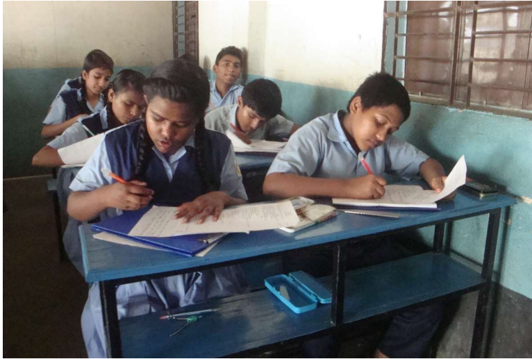
It's exam time

From 12 th June to 29 th June Jamgara school had their Mid Term Exam. This exam is mainly written exam. Additionally some students sat for the practical exam also. All the teachers participated in question paper making work last month. They prepared about 200 different types of questions. Before Eid vacation, students finished their exam successfully and they are very glad about it. After the Eid vacation, the class will resume on 10th July.